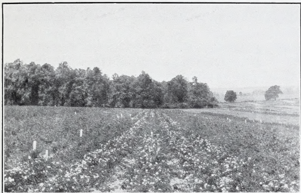
Long rows of Rosa Wichuraiana , the trailing Rose.